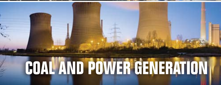
COAL AND POWER GENERATION